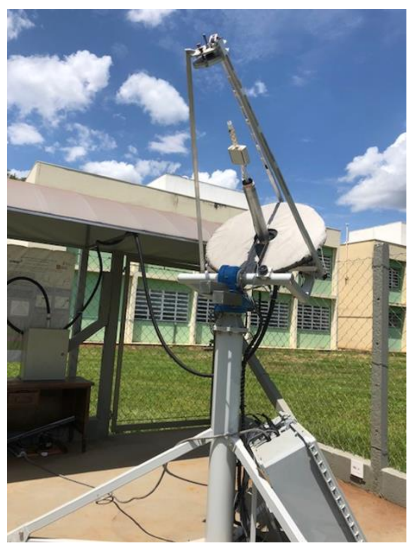
Figure xx. A prototype of energy concentrator coupled to optical fibers installed in the IQ-UNESP, Araraquara, SP.

shortly. The name of the project is "Energy concentrator coupled to optical fibers." Its function is to concentrate more efficiently the solar energy using mirrors coupled to an optical system (fiber optics) and to transport it to specific places. The system is flexible in responding to different purposes, for example, 1) disinfection of water by photocatalysis (original); 2) disinfection of animal manure; 3) drying of minerals; 4) lighting of large buildings; 5) heating water for the destruction of copper cyanide; (remediation); 6) machining of materials (3D manufacturing, cutting, etc.) (glass melting); 7) Desalination of seawater. The picture below (Figure xx) shows the prototype installed in the IQ-UNESP, Araraquara, SP.